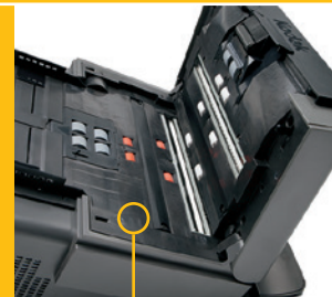
Robust build quality

STREAMLINED PROCESSES IMPROVED COMMUNICATION INCREASED PRODUCTIVITY