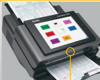
Improved paper handling